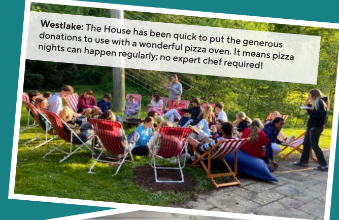
Westlake: The House has been quick to put the generous donations to use with a wonderful pizza oven. It means pizza nights can happen regularly; no expert chef required!

The Annual Fund is a pot of money, raised by the Development Office, and allocated to specific projects. At the start of each year the Development Office invites proposals from across the school. These are then considered at the Annual Fund Committee Meeting, and money is then raised for those selected projects.