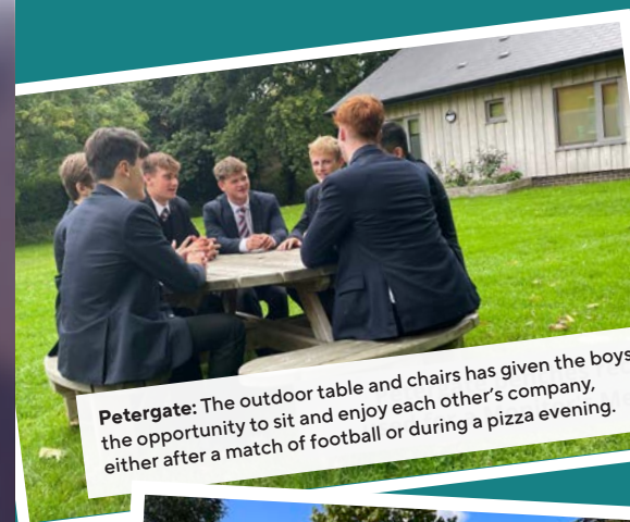
Petergate: The outdoor table and chairs has given the boys the opportunity to sit and enjoy each other's company, either after a match of football or during a pizza evening.